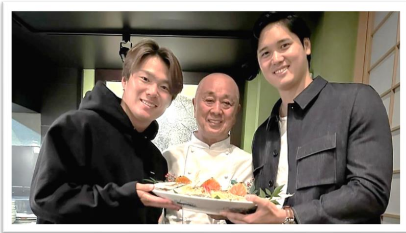
Yoshinobu Yamamoto, Chef Nobuyuki "Nobu" Matsuhisa and Shohei Ohtani at Matsuhisa Beverly Hills.

This year's BBT Oakland A's tailgate should really be special. It's your chance to see Shohei Ohtani, Yoshi Yamamoto and the Los Angeles Dodgers!