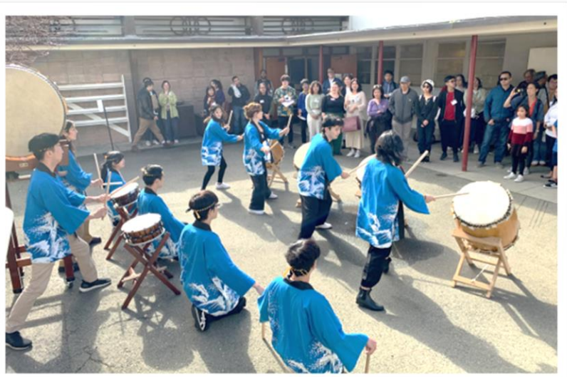
Cal Raijin Taiko