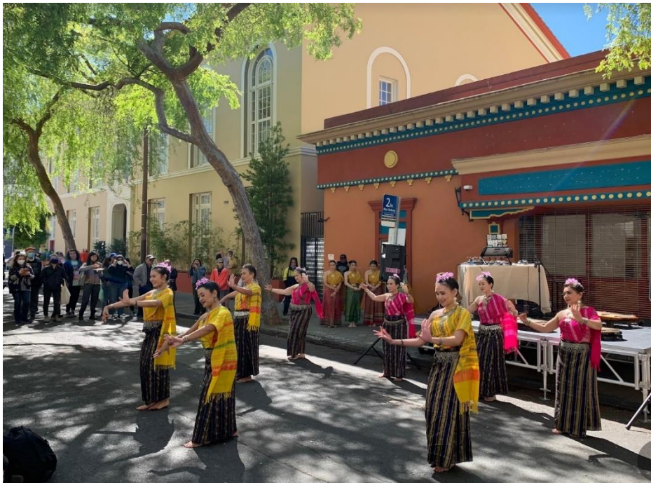
Thai Dancers