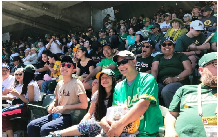
BBT Sangha members enjoy the game at the Oakland A's tailgate in June 2019