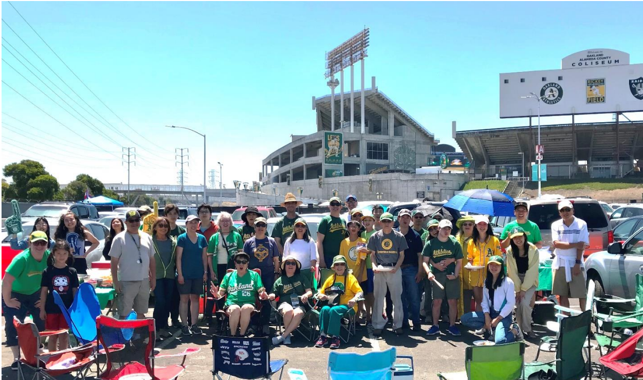
The BBT Sangha and friends pose for a group photo at the last BBT Oakland A's tailgate in June 2019.