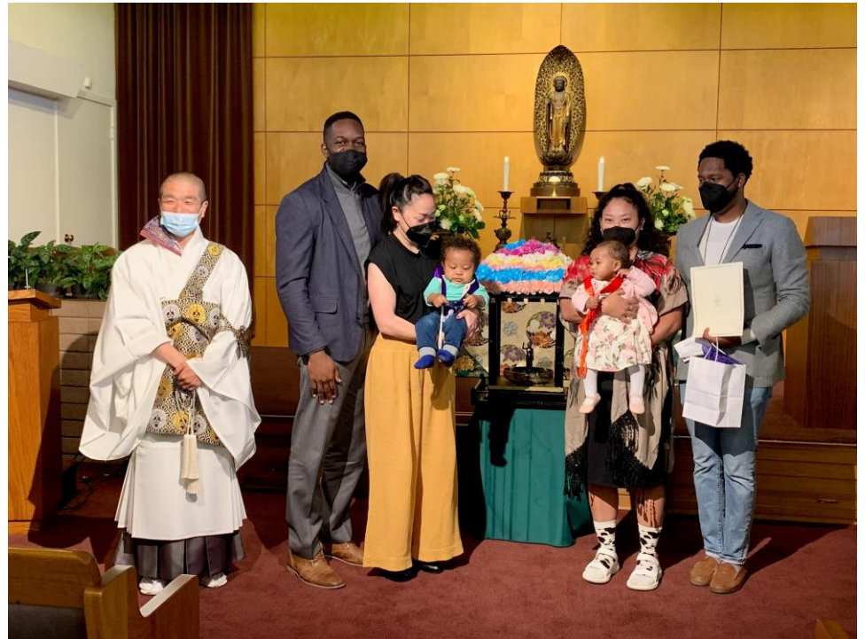
Welcome to the Hatsumairi babies !! See more pictures on page 8.

Our Vision A Community Where Our Spiritual Life and True Self Can Be Realized