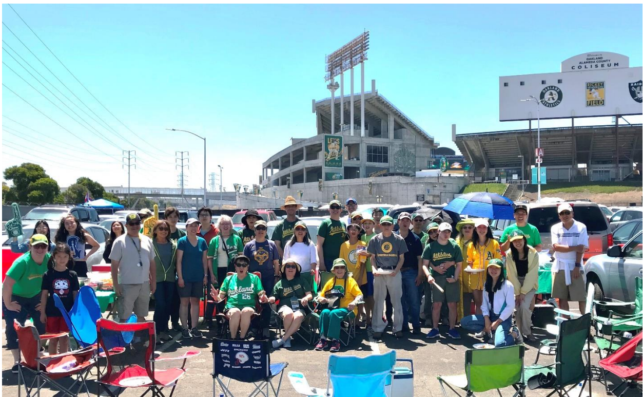
The BBT Sangha and friends pose for a group photo at the last BBT Oakland A's tailgate in June 2019.

Hope we can do this! It's been too long!)