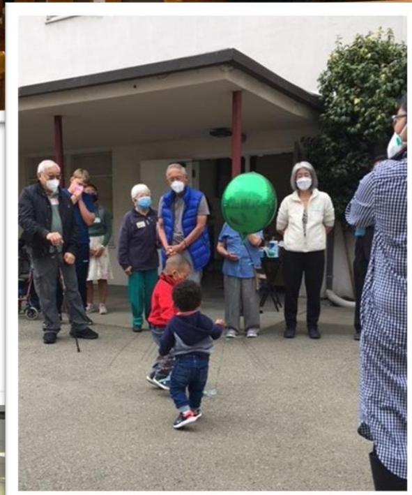
Breaking the ice across generations...