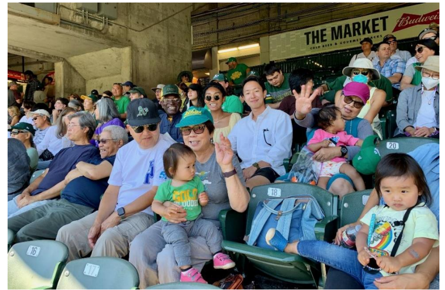
The BBT Sangha members, friends and supporters are enjoying the Oakland A's game.