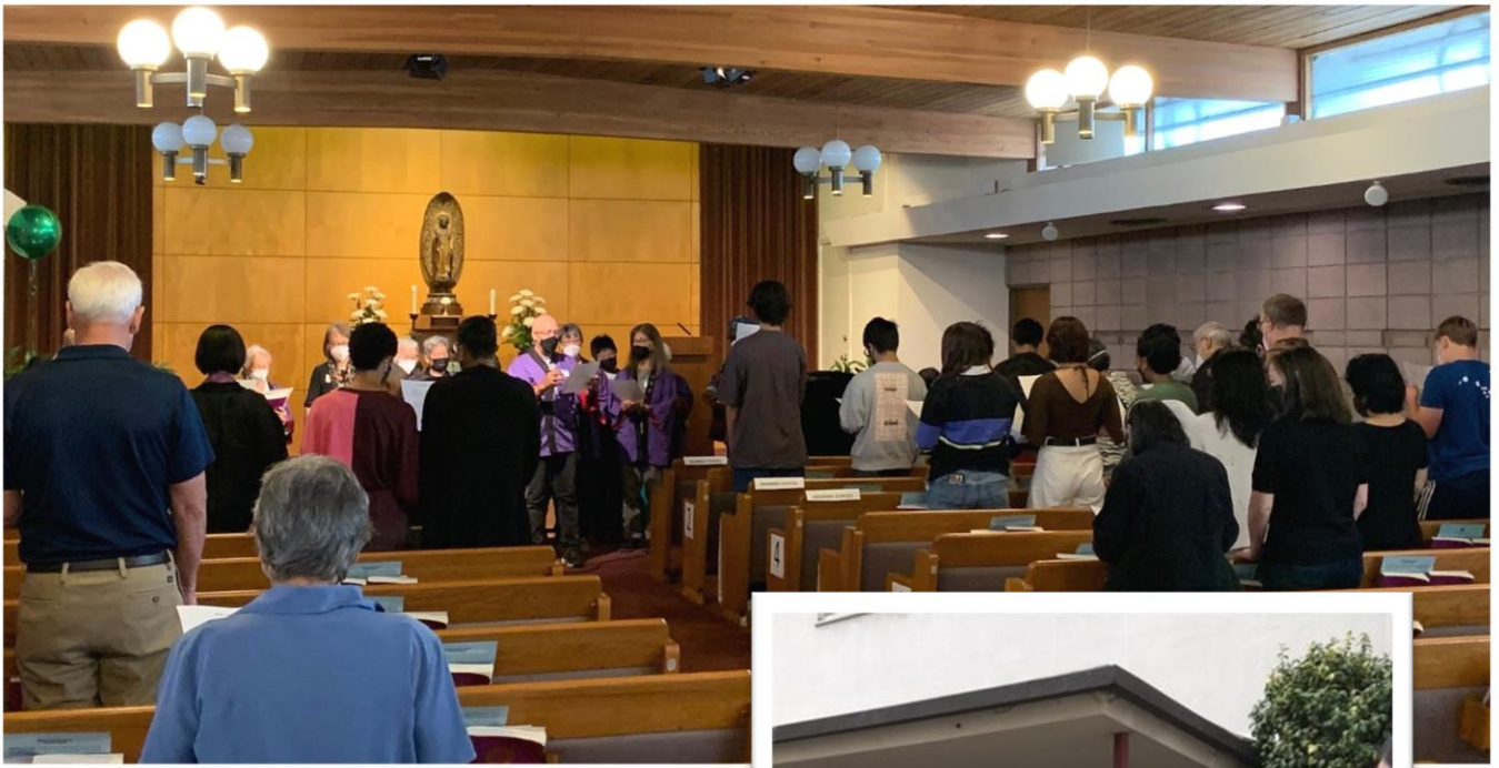
Singing aloud allowed !