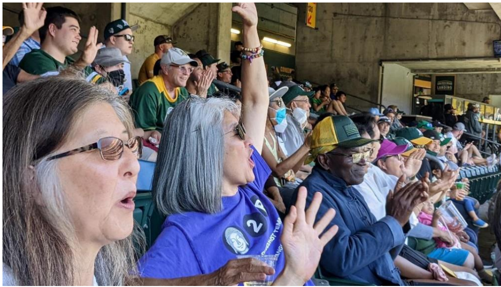
BBT Sangha members let out a huge cheer in reaction to seeing Berkeley Buddhist Temple on the Oakland A's scoreboard.