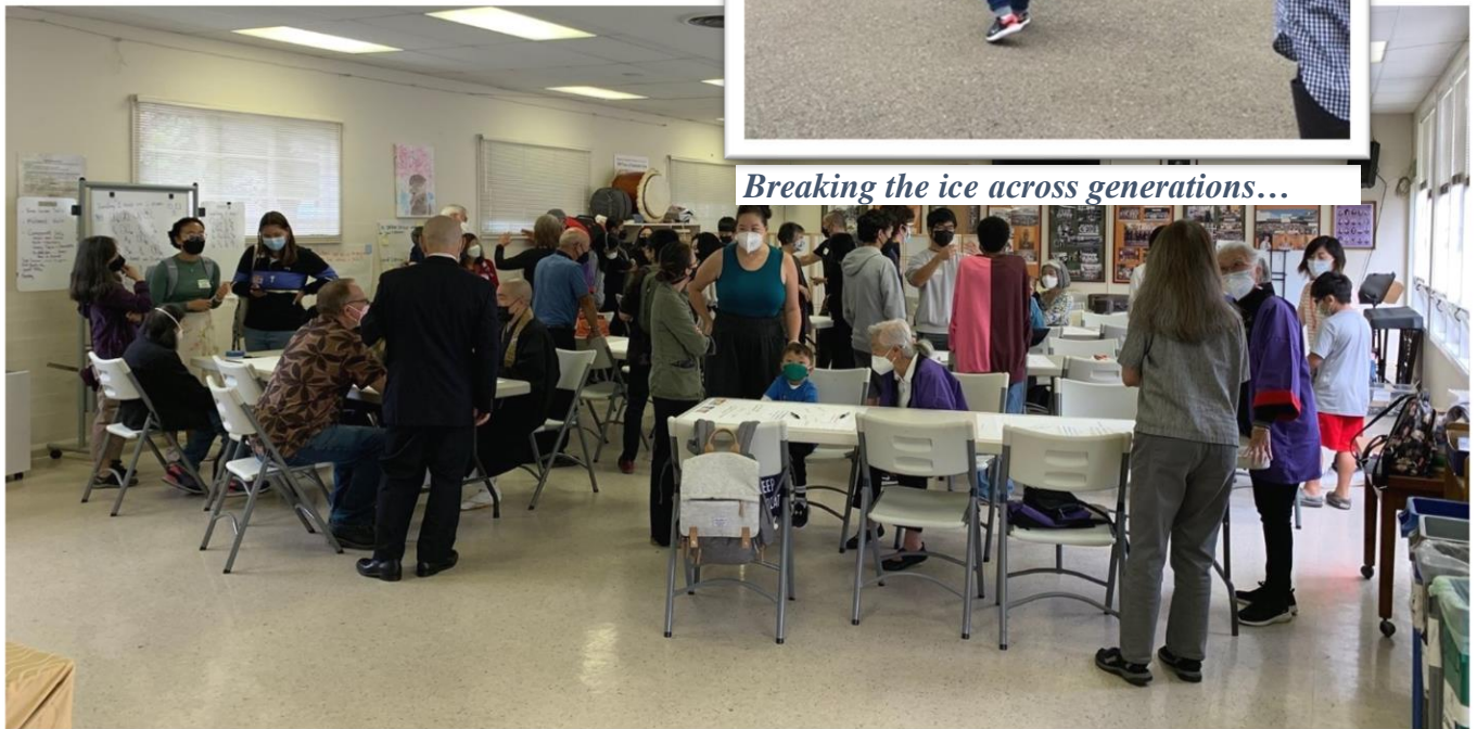
Social time !