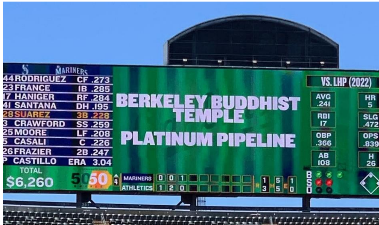
The Oakland A's welcome Berkeley Buddhist Temple on the team's scoreboard.